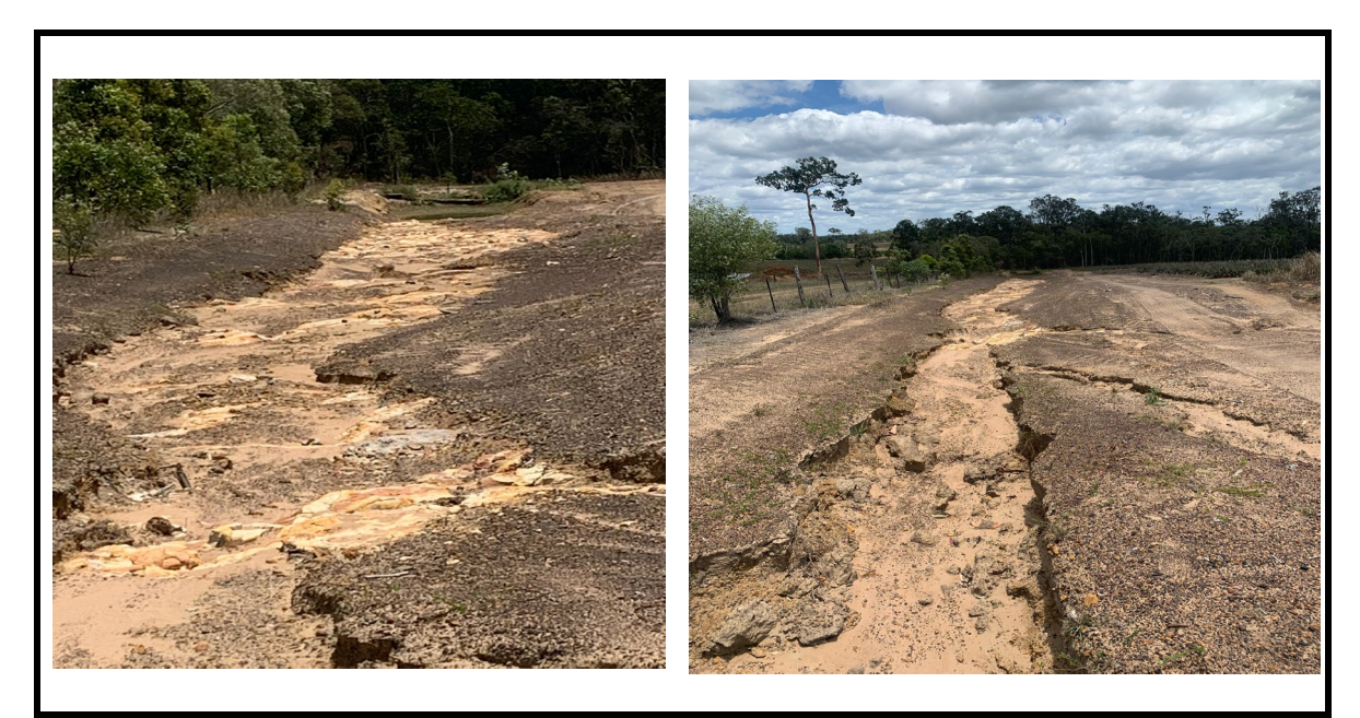
Figure 8: Treatment 2A - scouring within drain at 12 months (left). Drain one month after installation (right).

Treatment 2A consisted industry standard practices with no coverage or stabilisation of the drain. Observations over the 12 month period indicated severe scouring has occurred 40 - 60cm down to the hard rock and clay layers within the soil profile. The drain has limited capacity to retain any sediment and will continue to scour further over future rainfall events. A reinforced silt trap at the bottom of the drain was constructed to capture sediment but has not had the capacity to retain all of the erosion coming off the catchment area. High levels of sediment have overflowed the silt trap and left the farm.