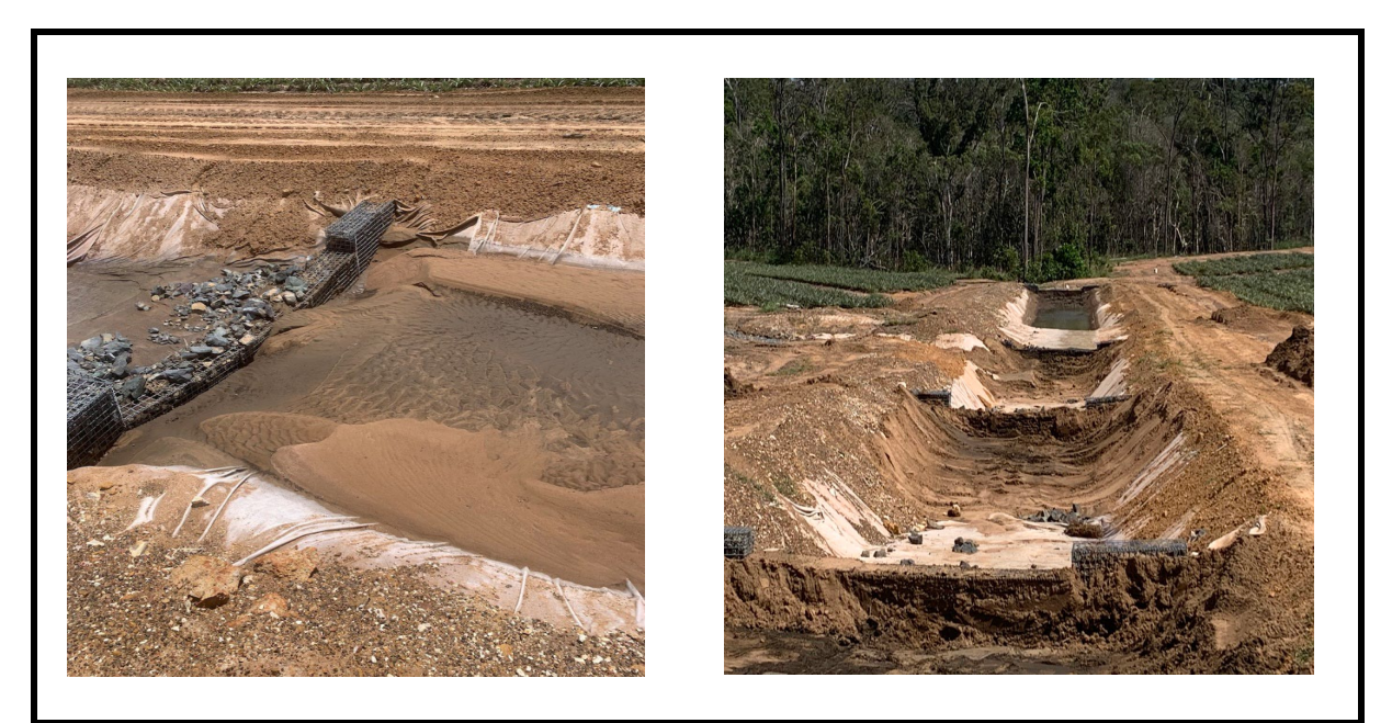
Figure 9: Treatment 2B - Sediment captured behind levy bank (left). Sediment removed from primary drain (right).

Treatment 2B consisted an open drain stabilised by Geofabric, segregated by three gabian basket levy banks with a silt trap located at the bottom. The catchment area emptying into this drain is from beds planted up and over slopes with no contour banks (standard practice). Within this treatment a high level of erosion from the catchment area has been contained by the gabian basket levy banks. The containment of the sediment has primarily occurred above each of the gabian basket levy banks which require continual maintenance.