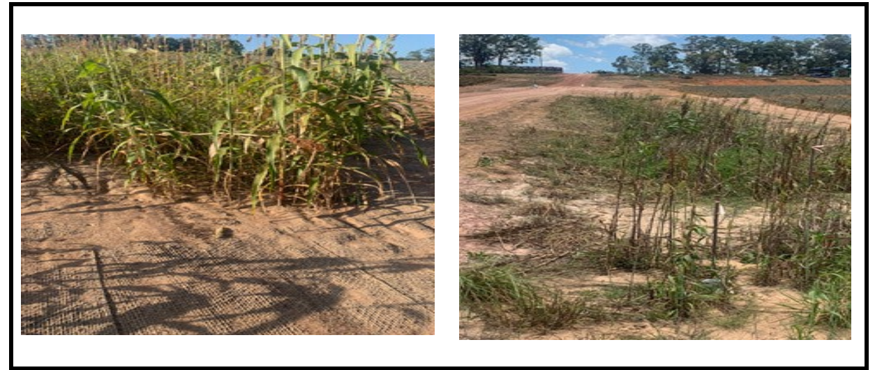
Figure 10: Treatment 2C - eroded soil captured on jute mesh (left). Vegetated drain at 12 months (right).

Treatment 2C consisted an open drain stabilised by Jute Mesh as a ground cover then planted with a vegetative crop of sorghum. The drain then emptied into a sediment pond at the bottom. The catchment area emptying into this drain consisted beds planted down the hill with contour drains across the slope. Within this treatment moderate levels of sediment were captured in the drain, however a good volume of sediment over-flowed into the sediment pond moving around the planted vegetation.