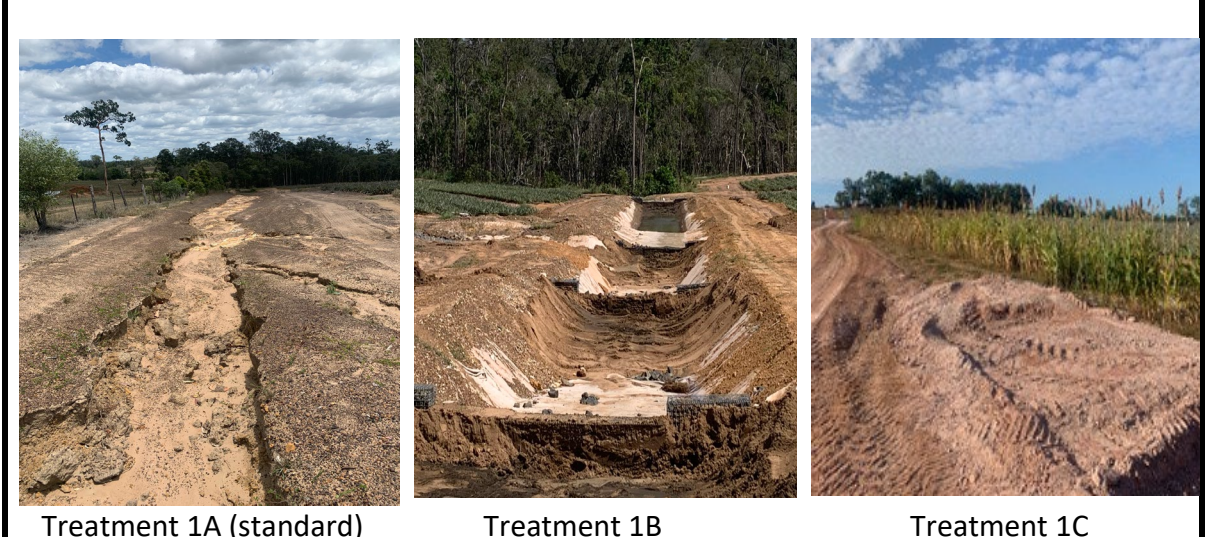
Treatment 1A (standard)

Treatment 2C consisted an open drain stabilised by jute mesh as a ground cover then planted with a vegetative crop of sorghum. The drain then emptied into a sediment pond at the bottom.