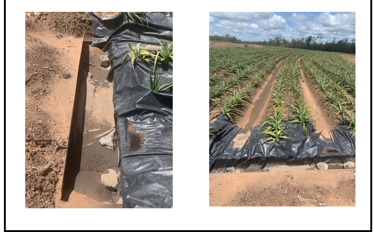
Figure 6: Treatment 1B - low amounts of sediment and evidence of water logging in field.