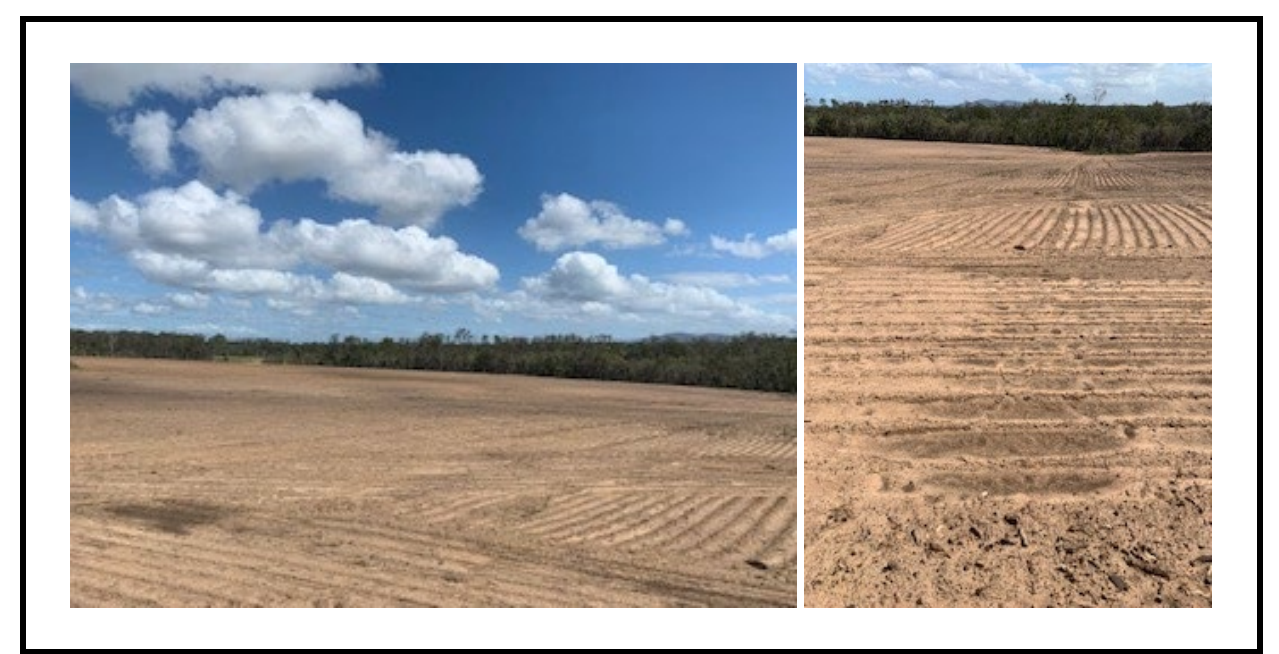
Figure 1: trial site - prior to treatments

The total demonstration site is 3.5 ha consisting three different block layouts draining directly into three outfield drains. The total site was planted with smooth cayenne on a sandy loam soil type to a depth of 0.3 to 0.4 m with a heavy clay subsoil. The site is a westerly facing aspect with a varying 0.5 to 1.5% slope.