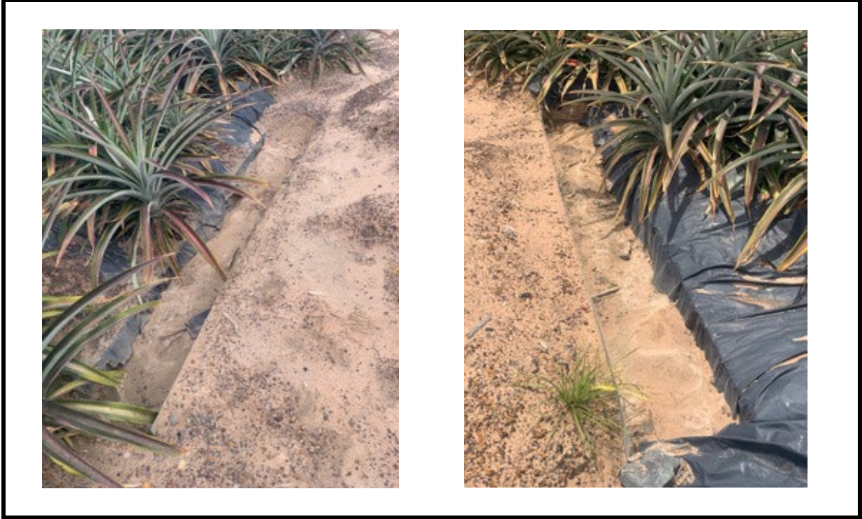
Figure 7: Treatment 1C – moderate amounts of sediment in catchment troughs.